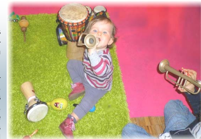
Having fun with a Trumpet Kazoo at a marketing event in France

The sales to SPYRA in the second half of 2010 made them one of SASi's largest volume kazoo customers for the whole year. If the test marketing is successful, and they go ahead with inclusion of the kazoos, it will significantly increase production and sales for the Original Kazoo Company.