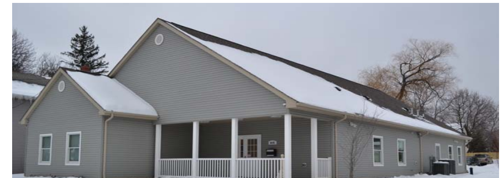
New Eden Prevocational and Day Habilitation Building

In December 2010, SASi opened a new Day Program on South Main Street in Eden, NY next door to the Original Kazoo Company.